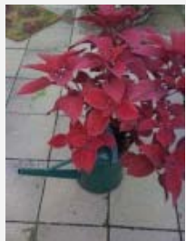
Red Head coleus

Red Head ( Solenostemon hybrida ) Versa Crimson Gold Coleus ( Solenostemon scutellarioides )