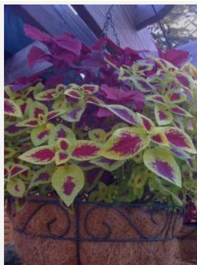
Coleus gave my garden bright season-long color.

Tags: bicolor, coleus, hanging basket, henna, Red Head, Redhead, Solenostemon, Versa Crimson Gold Coleus Solenostemon scutellarioides