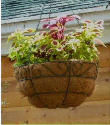
Bright color all season

All coleus will be gone with the first freeze, but till then, these plants provide bright, bold color on the patio.