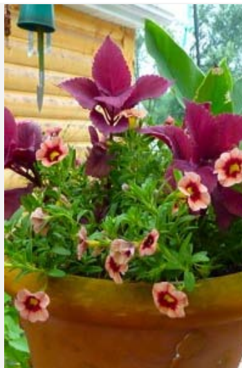
Most of my trial plants went in containers like this.